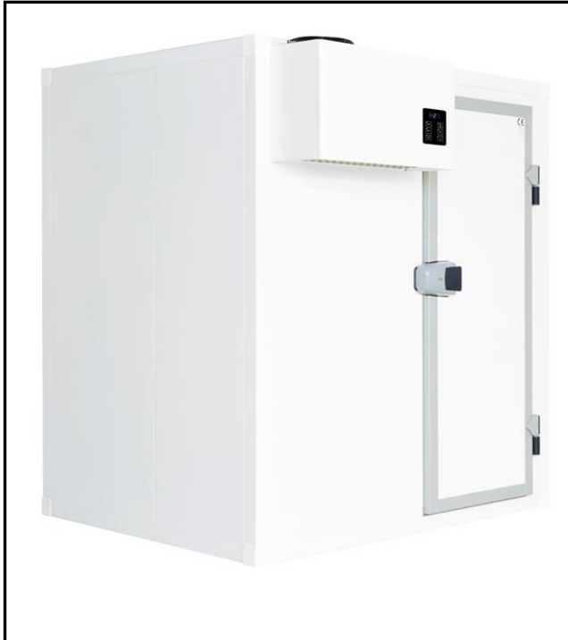
102087 (CRF2824B20N) Cold/Freezer Room 2430x2830 th.100mm, included Unit